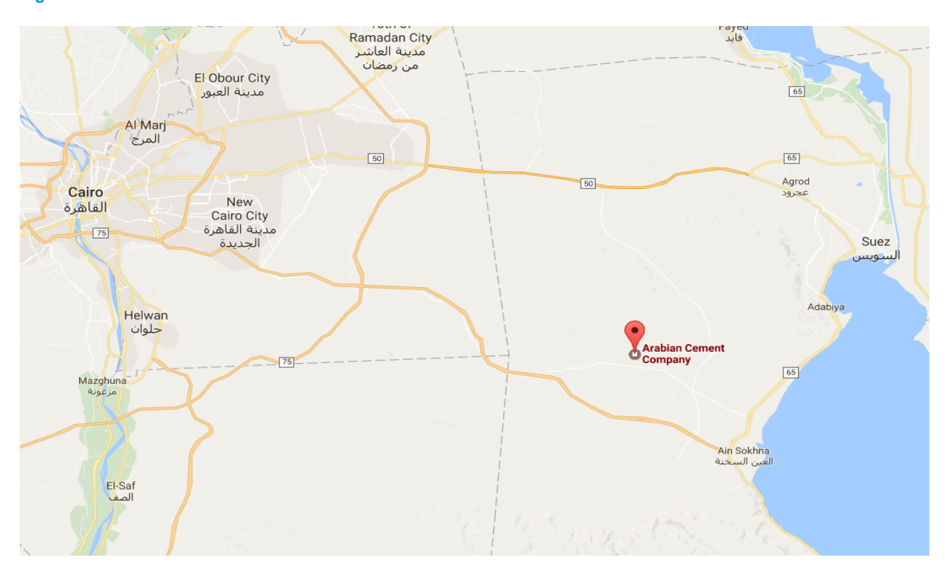
Figure 1-2 Aerial view of the site